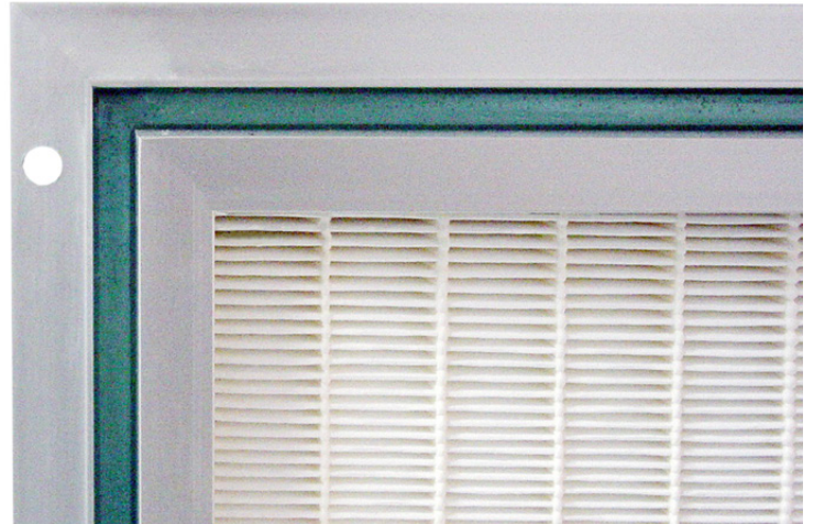
Tri-Pure panel filter showing the reverse perimeter gel seal track and flange used to mount in the module.

In addition to the GSR 2 , Tri-Dim offers the Tri-Pure GSR gel seal replaceable hood—our premium module that offers a full range of features, including an optional aerosol injection port.