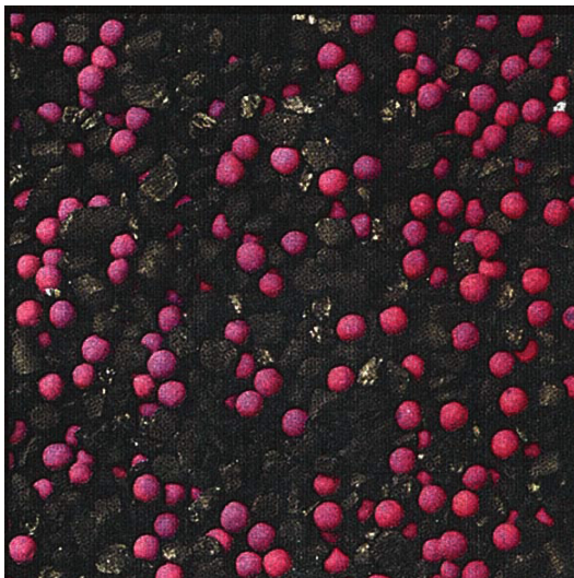
GAC/PP 50/50 Blend

Tri-Dim offers a full selection of Gas Phase bulk medias to remove a broad spectrum of Airborne Molecular Contaminants (AMC). The medias highlighted below are the more commonly requested medias – specialty medias are also available. Please contact your local representative for more information on other medias.