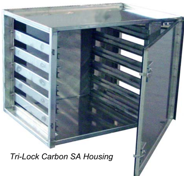
Tri-Lock Carbon SA Housing