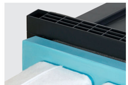
hydroMaxx clipped on main filter