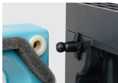
Couplings on the hydroMaxx and pins on the main filter allow fast and safe installation