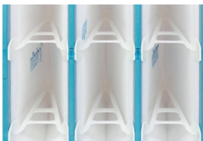
Fully integrated supporting ribs avoid collapsing pockets